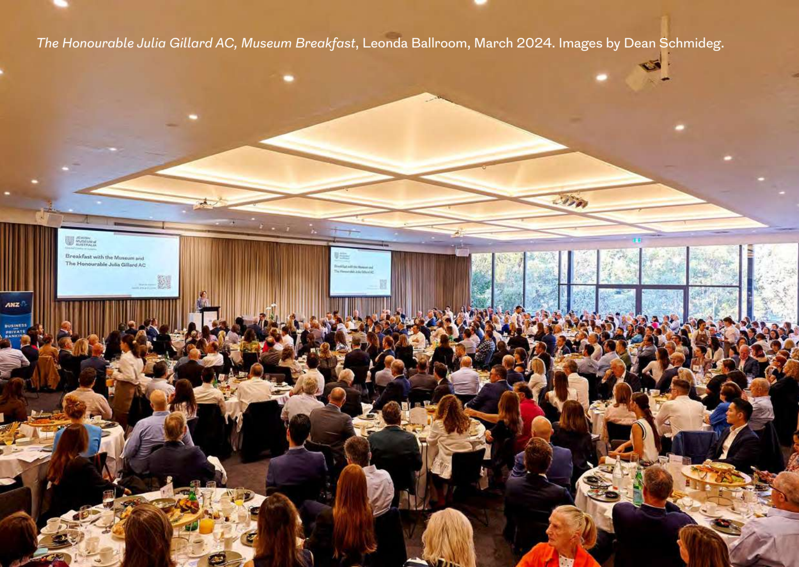
The Honourable Julia Gillard AC, Museum Breakfast, Leonda Ballroom, March 2024.