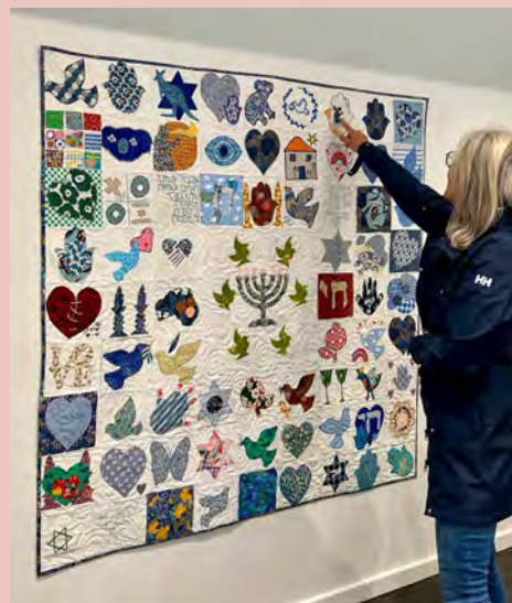
← Quilt for Hope, community activity and installation, October 7, 2024.

“It is with pride and strength that I come here as a Jewish Australian celebrating who I am and never forgetting the solemnity of this day, October 7. I believe in Australia and a brighter future.” — JMA Visitor, October 7 2024