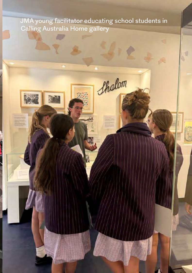
JMA young facilitator educating school students in Calling Australia Home gallery