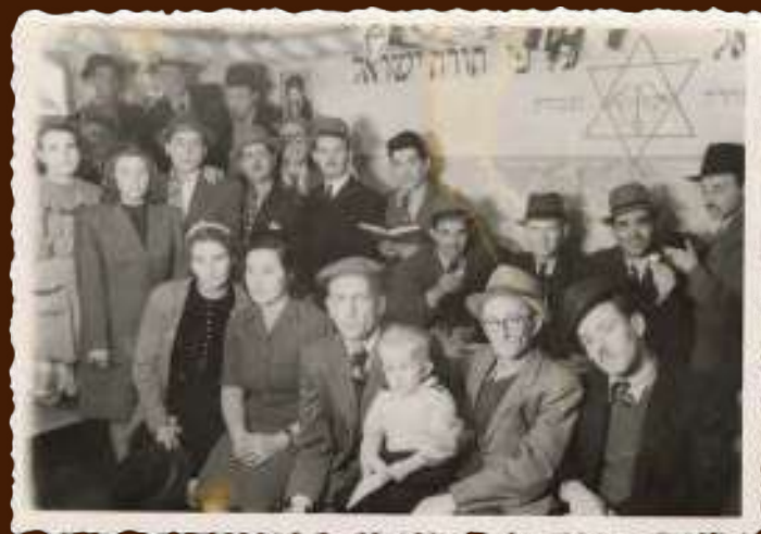
← Group of people at Ansbach Displaced Persons Camp - Gross (Grosz) Family Collection 1947, Germany Photographic print on paper, 81 x 118mm Donated by Eva Gross Jewish Museum of Australia Collection 14005.6

“To be the light is to be supporting to others when they face a struggle. This could mean talking to them about the issue, standing up to anyone who bullies them, or simply being there when they need. It is to act as a light to guide them through a darkness.” — Year 7 Student, Brighton Secondary