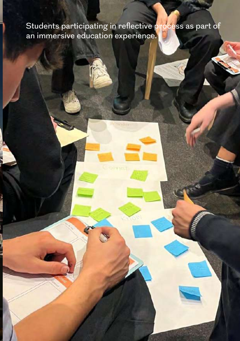
Students participating in reflective process as part of an immersive education experience.