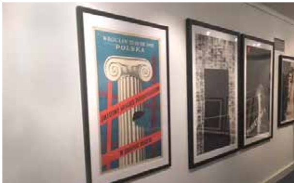
The Art of the Polish Poster School 11 May – 10 August 2016

This exhibition presented a selection of posters from the Polish Poster School, which was established after the Second World War as a form of communist propaganda. The poster was one of the few permitted means of autonomous artistic expression, and despite the cultural oppression of the communist regime, the Polish poster movement was still able to thrive as an art form.